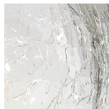
Clear Cracked Lead Crystal