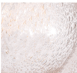
Clear Bubbled Glass