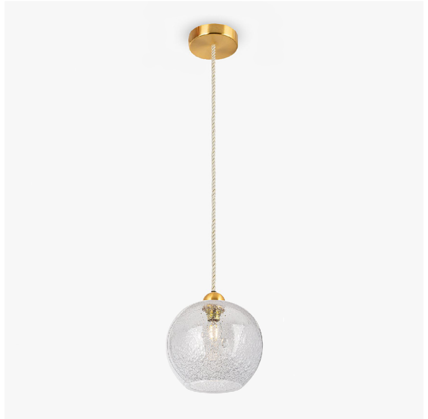
CL377 in Clear Soda Glass and Brushed Gold

The Contour Collection favourites, Arctic and Glacier have made a comeback this year bringing with them a new addition, Foss, as they form a triptych of pendants. Foss, meaning waterfall, is representative of rushing white water, hundreds of bubbles trapped within an effervescent glass dome.