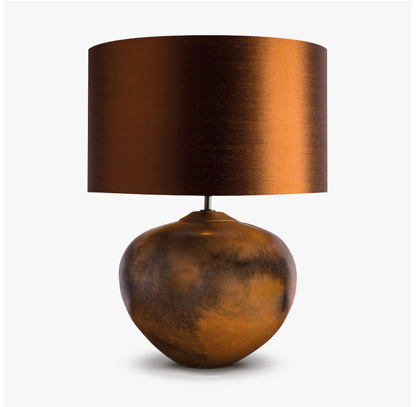
TL165 in Burnt Sienna and Polished Nickel and 15" Short Drum Shade in Silk Dupion 5018W 2029

Please note the intricate patterns on the surface of the Fornax range are created entirely organically from smoke and fire and will therefore vary slightly from piece to piece.