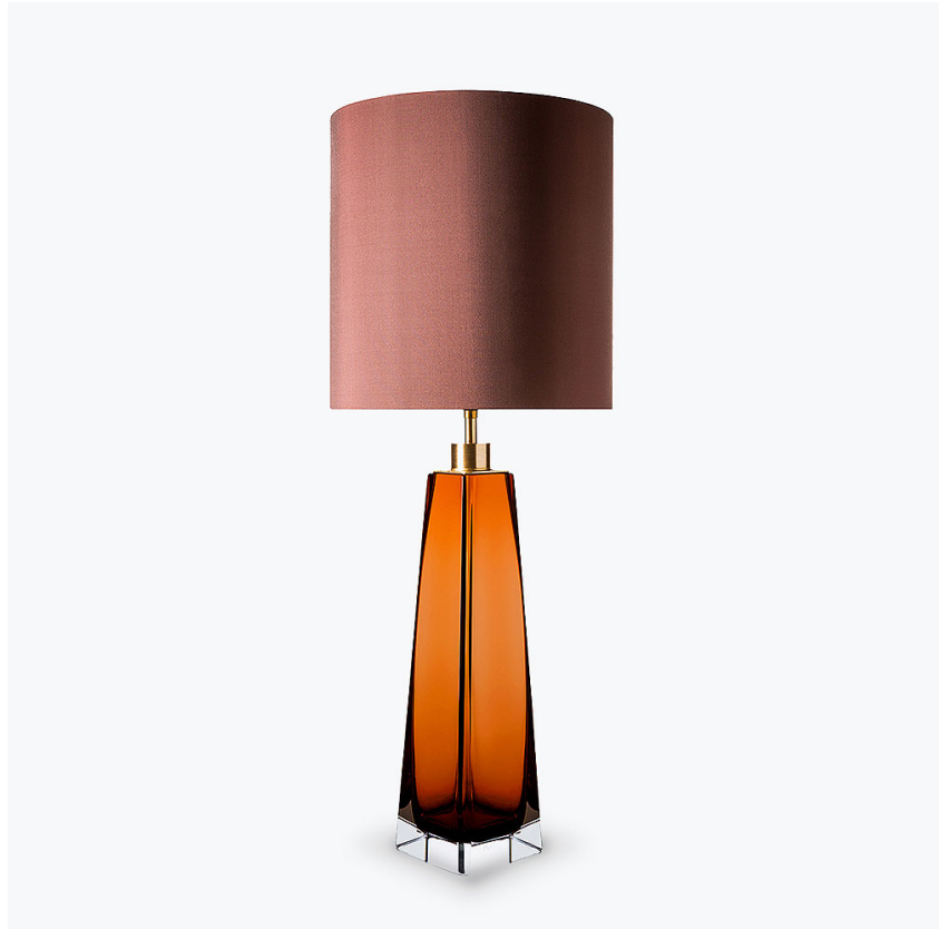
TL709 in Tobacco and Clear Glass and Brushed Gold with a 11" Tall Drum Shade in Dupion 5018W/ 306