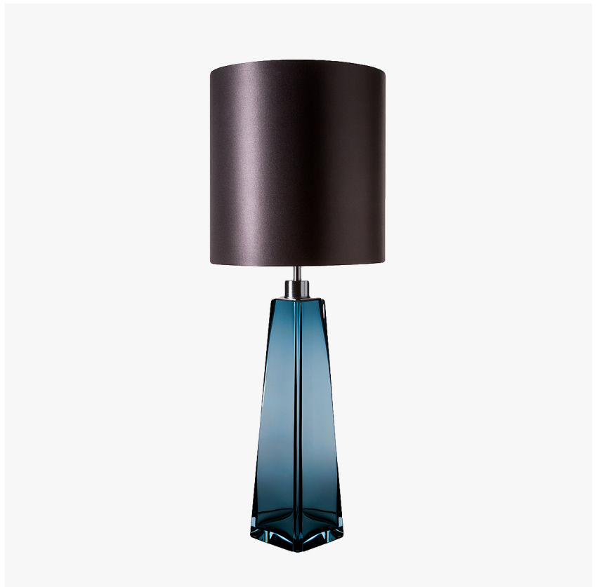
TL709 in Petrol Blue and Clear and Brushed Nickel with a 11" Tall Drum Shade in 1806W/ 570 Old Navy