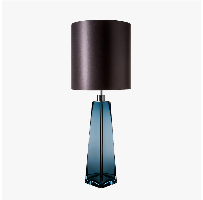
TL709 in Petrol Blue and Clear and Brushed Nickel with a 11" Tall Drum Shade in 1806W/ 570 Old Navy