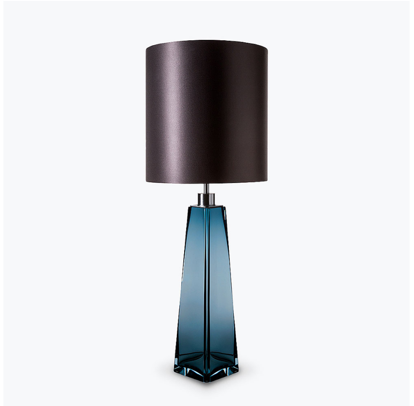
TL709 in Petrol Blue and Clear and Brushed Nickel with a 11