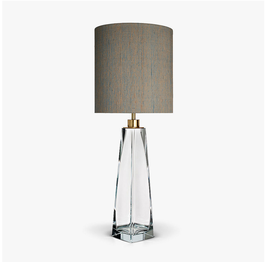
TL709 in Clear Glass and Brushed Gold with 11" Tall Drum Shade in Bennetts Silk Cochin