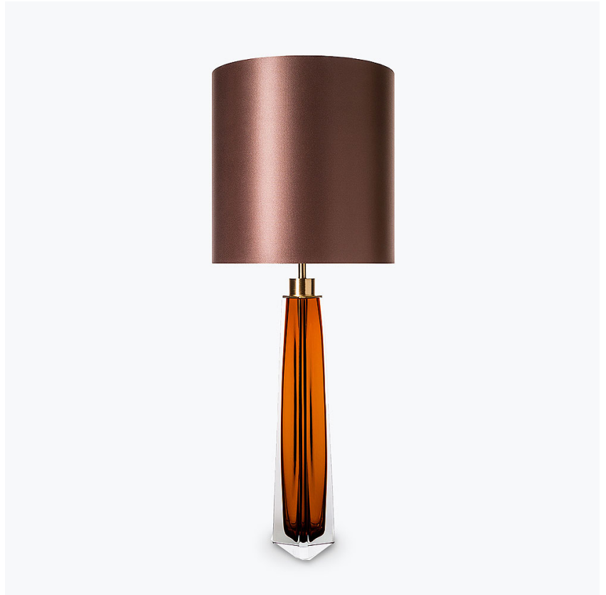
TL708 in Tobacco and Clear Murano Glass and Brushed Gold with a 11" Tall Drum Shade in 1806W/ 102 Grey Plum