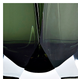
Forest Green & Clear