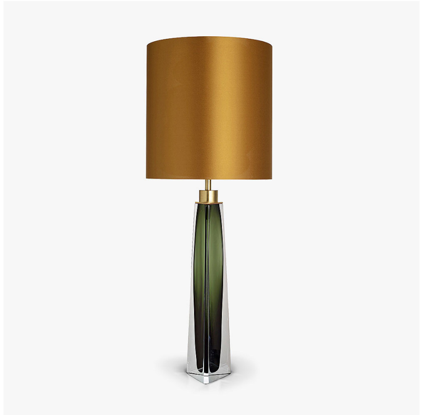
TL708 in Forest Green and Clear Murano Glass and Brushed Gold with a 11" Tall Drum Shade in 1806W/ 70 Ochre