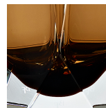
Tobacco & Clear