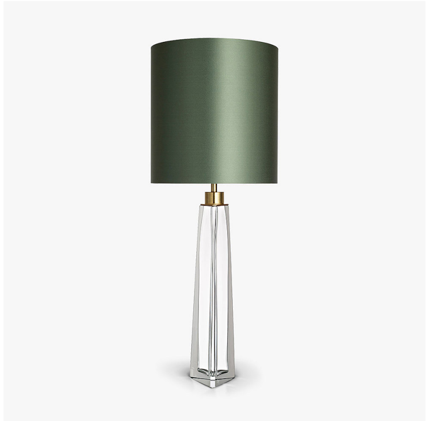
TL708 in Clear and Brushed Gold with 11" Tall Drum Shade 1806W/ 120 Dill