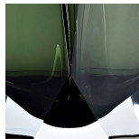
Forest Green & Clear