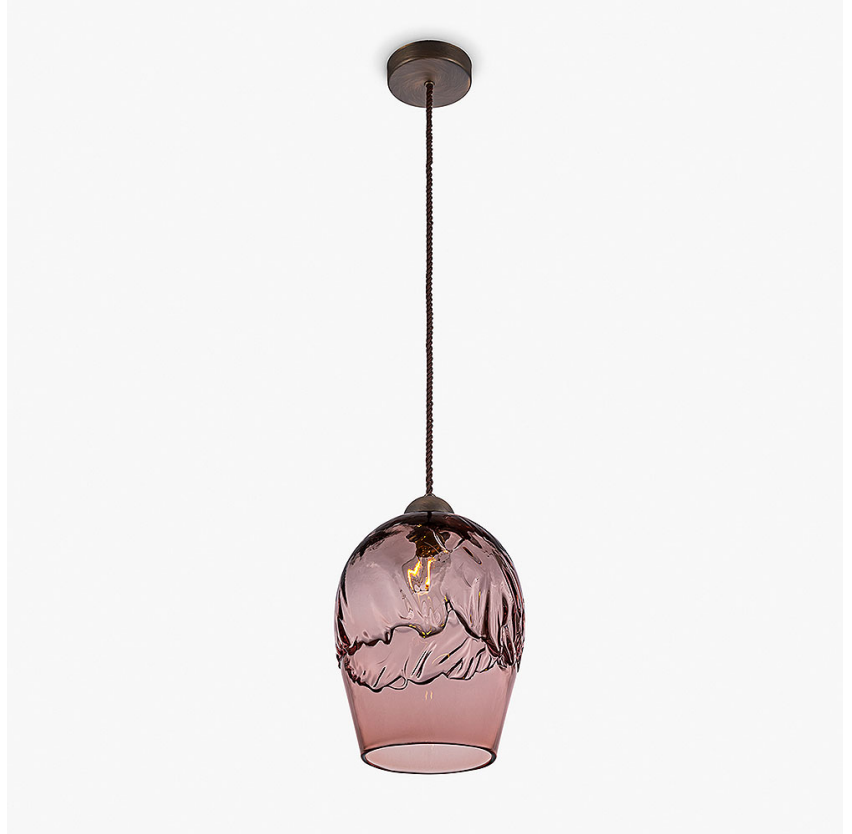
CL238 in Tea Glass and Brushed Dark Bronze with Brown Flex

Finish note: As these pendants are handmade by our artisans in England and are a unique design, each pendant varies slightly in design and size from one another