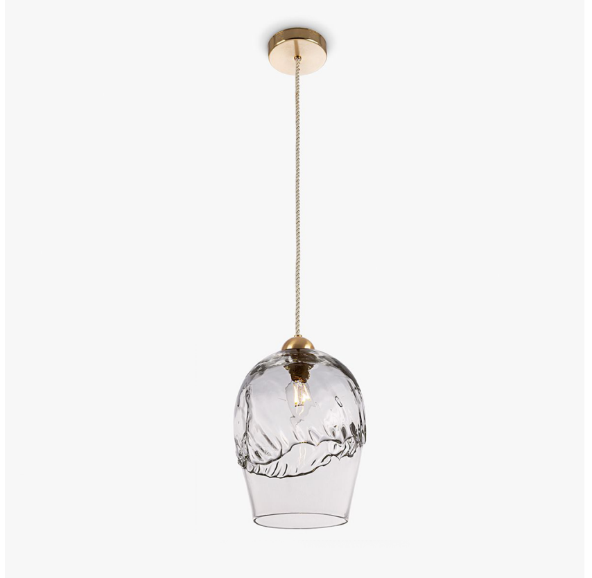
CL238 in Clear Glass and Brushed Gold with Silver Flex

Finish note: As these pendants are handmade by our artisans in England and are a unique design, each pendant varies slightly in design and size from one another