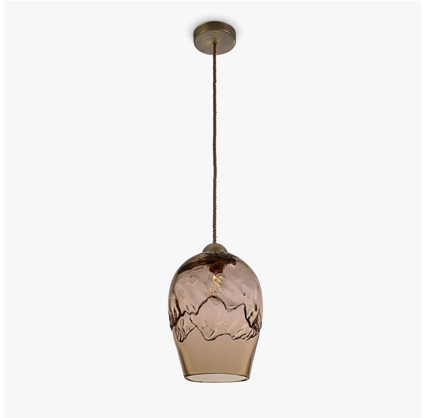
CL238 in Bronze Glass and Brushed Dark Bronze with Brown Flex

Finish note: As these pendants are handmade by our artisans in England and are a unique design, each pendant varies slightly in design and size from one another