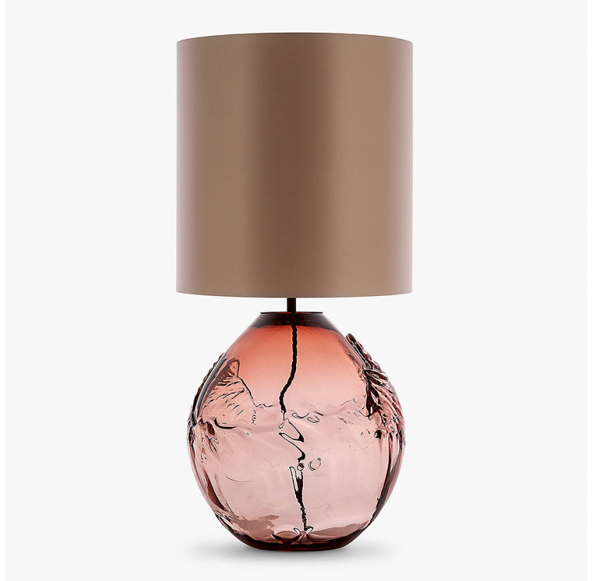
TL238 in Tea Glass and Brushed Dark Bronze with an 12" Tall Drum Shade in Crepe Satin 1806W/012 Frosted Almond