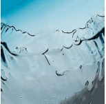
Crest Ocean Blue