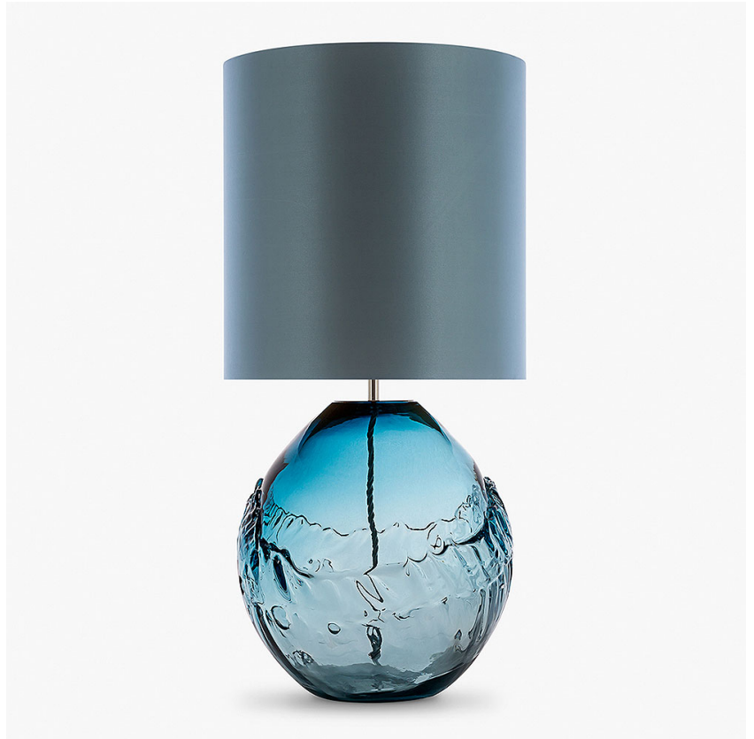
TL238 in Ocean Blue Glass and Brushed Nickel with a 12" Tall Drum Shade in Crepe Satin 1806W/0312 Mist

Finish note as these lamps are handmade by our artisans in England, they may vary slightly from piece to piece in dimension and appearance.