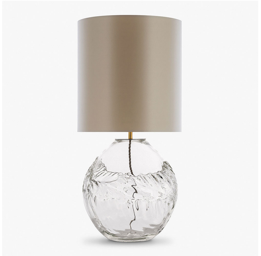
TL238 in Clear Glass and Brushed Gold with an 12" Tall Drum Shade in Crepe Satin 5018W/4501 Platinum

Finish note as these lamps are handmade by our artisans in England, they may vary slightly from piece to piece in dimension and appearance.