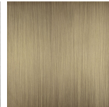
Brushed Dark Bronze