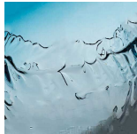
Crest Ocean Blue