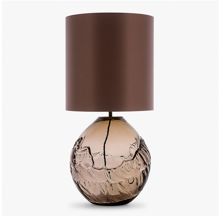
TL238 in Bronze Glass and Brushed Dark Bronze with an 12" Tall Drum Shade in Crepe Satin 1806W/326 Nutmeg

Finish note as these lamps are handmade by our artisans in England, they may vary slightly from piece to piece in dimension and appearance.