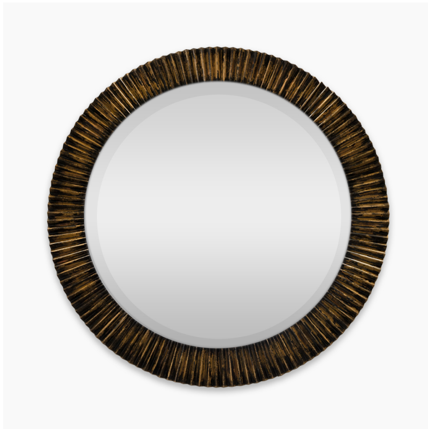
Concertina Straight Mirror in Distressed Bronze

A more contemporary piece designed in a distressed bronze finish from the brutalist era of the 1970s. Encompassing the glass is a multitude of brass v-shaped strips welded together to create a subtle lighting effect.