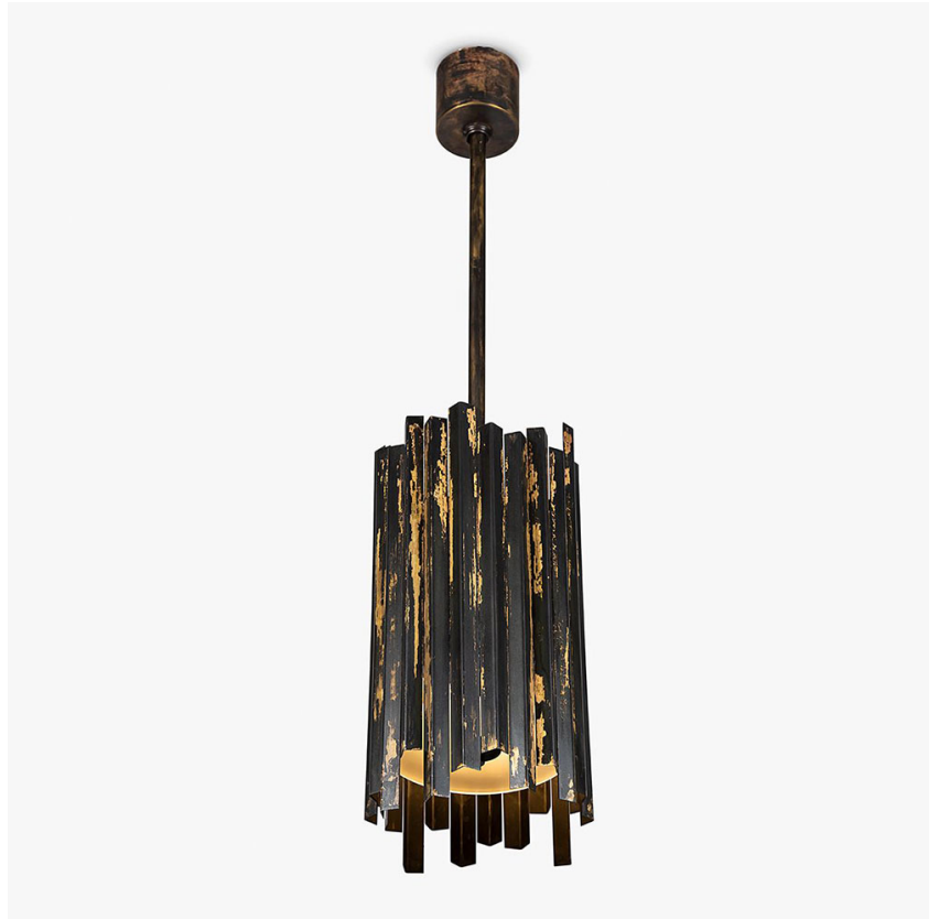
CL114-PEN in Distressed Bronze with a Lucite Diffuser