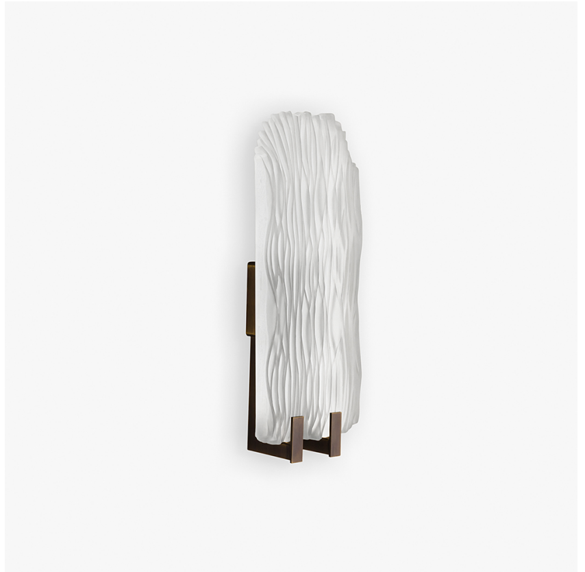
WL211-RECT in Satin Glass and Brushed Dark Bronze