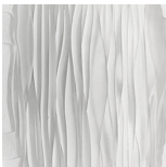
Clair de Lune Satin