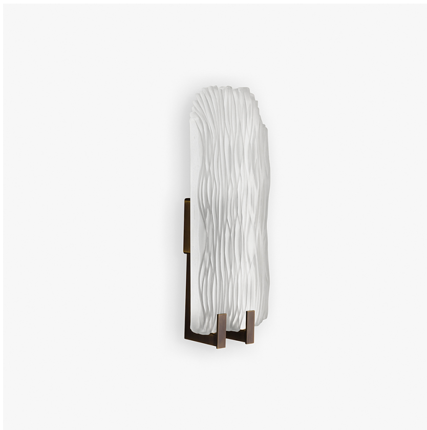
WL211-RECT in Satin Glass and Brushed Dark Bronze