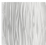
Clair de Lune Satin