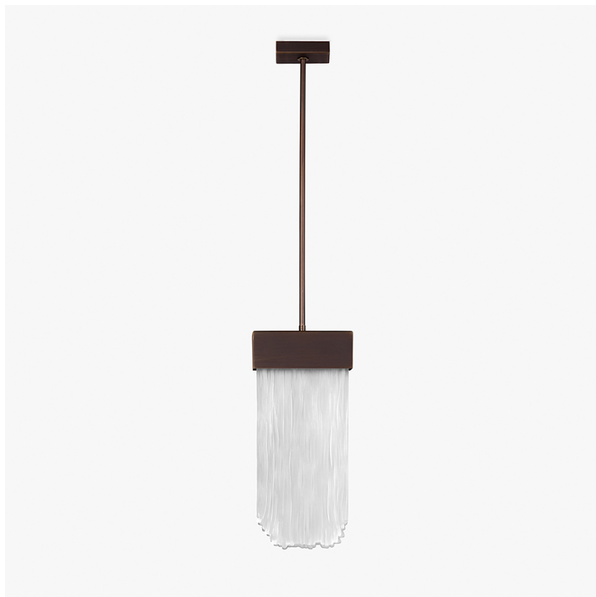
CL211-PEN in Satin Glass and Brushed Dark Bronze

The classic romantic image of the moon illuminating rippled water. We developed a way of melting, fusing and shaping the perfect 3D illustration of this scene in glass. The undulations in the glass appear to sway and pulse as the light hits the frozen waves, all clasped by understated, sleek metalwork to keep your eyes undistracted from the play of light within. To preserve the image as we imagined, the glass is solely available in a Satin finish but the metal details can be created in a number of our house finishes; Brushed Gold, Brushed Nickel or Brushed Dark Bronze to subtly adapt the look of these distinctive designs.