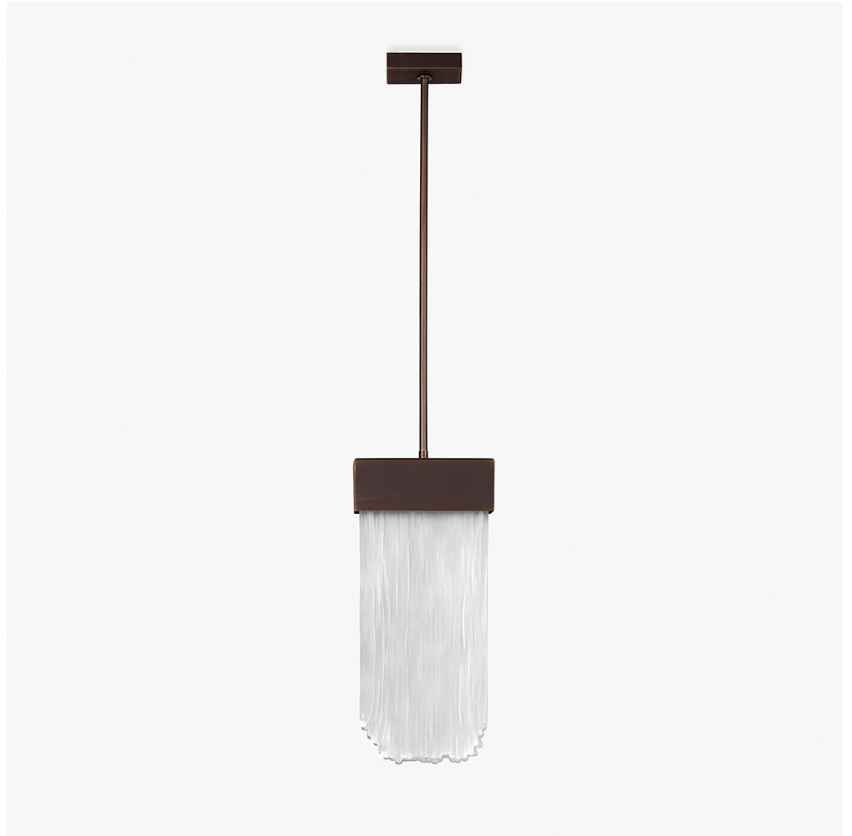
CL211-PEN in Satin Glass and Brushed Dark Bronze

The classic romantic image of the moon illuminating rippled water. We developed a way of melting, fusing and shaping the perfect 3D illustration of this scene in glass. The undulations in the glass appear to sway and pulse as the light hits the frozen waves, all clasped by understated, sleek metalwork to keep your eyes undistracted from the play of light within. To preserve the image as we imagined, the glass is solely available in a Satin finish but the metal details can be created in a number of our house finishes; Brushed Gold, Brushed Nickel or Brushed Dark Bronze to subtly adapt the look of these distinctive designs.