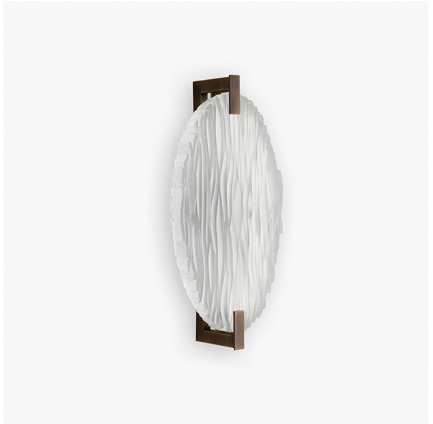
WL211-OVAL in Satin Glass and Brushed Dark Bronze