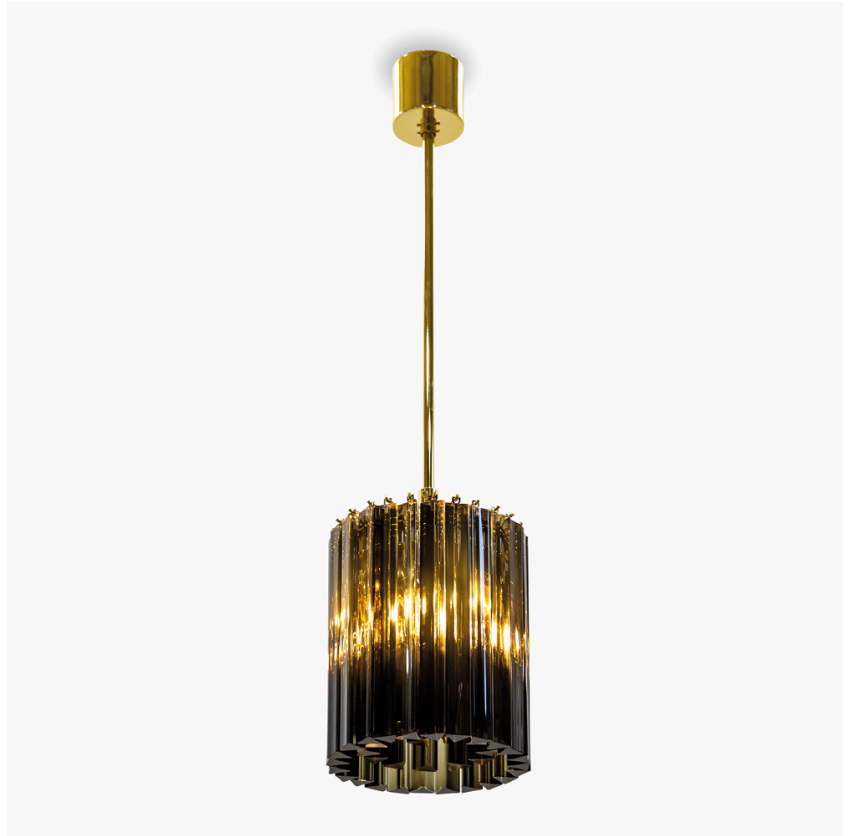
CL412-25 in Smoke Triangular Flat Cut Murano Glass and Polished Gold

UL (Underwriters Laboratories) test certificates available for the USA - will incur a surcharge IEC (International Electrotechnical Commission) test certificates available - will incur a surcharge