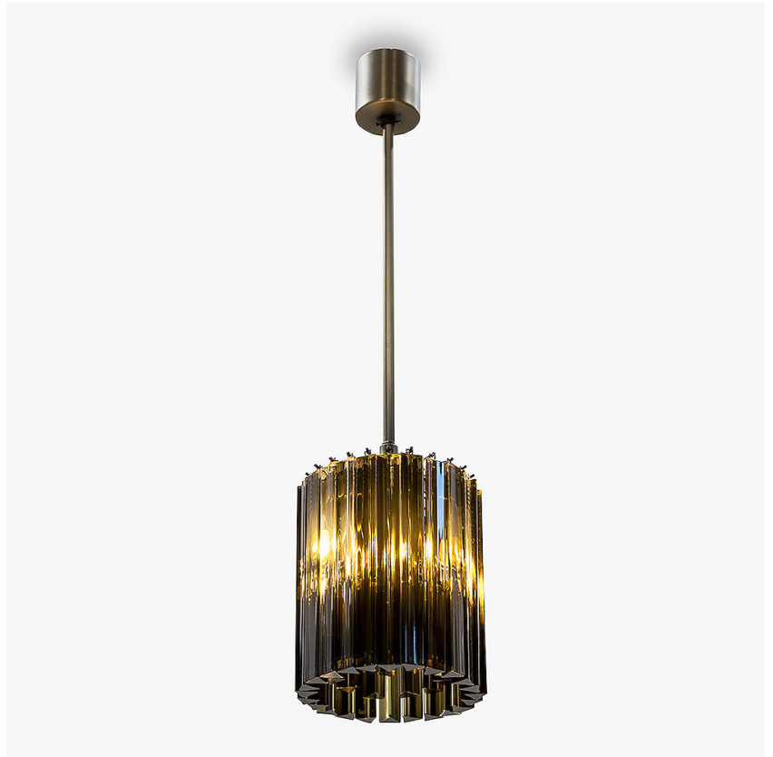
CL412-25 in Smoke Triangular Flat Cut Murano Glass and Brushed Dark Bronze

IEC (International Electrotechnical Commission) test certificates available - will incur a surcharge