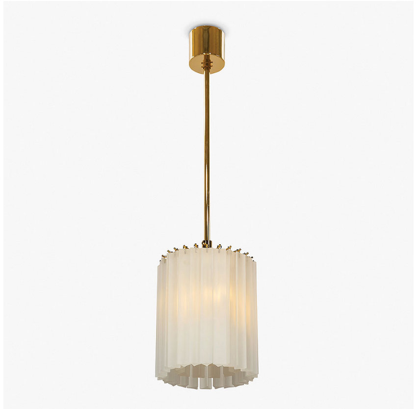
CL412-25 in Satin Triangular Flat Cut Murano Glass and Polished Gold

IEC (International Electrotechnical Commission) test certificates available - will incur a surcharge