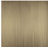
Brushed Dark Bronze