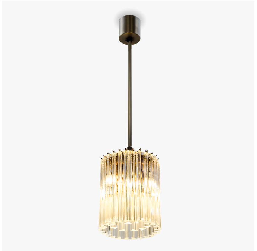
CL412-25 in Clear Triangular Flat Cut Murano Glass and Brushed Dark Bronze

IEC (International Electrotechnical Commission) test certificates available - will incur a surcharge