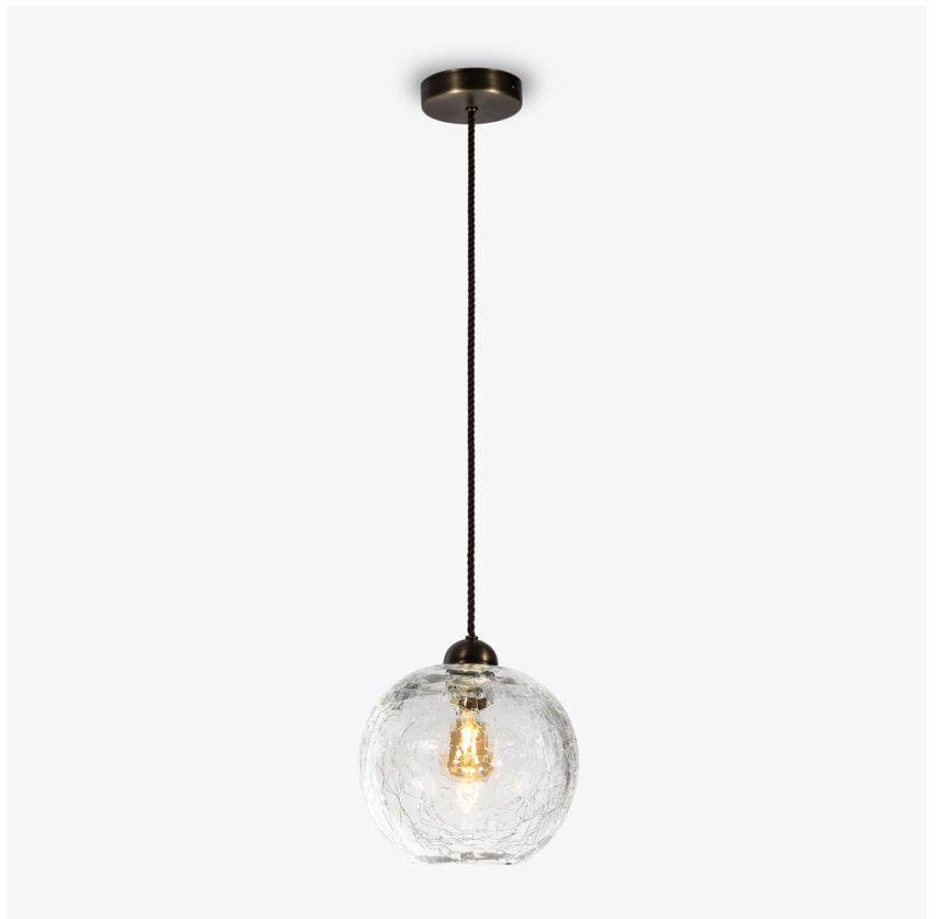
CL375 in Clear Crackled Glass and Brushed Dark Bronze with Brown Flex