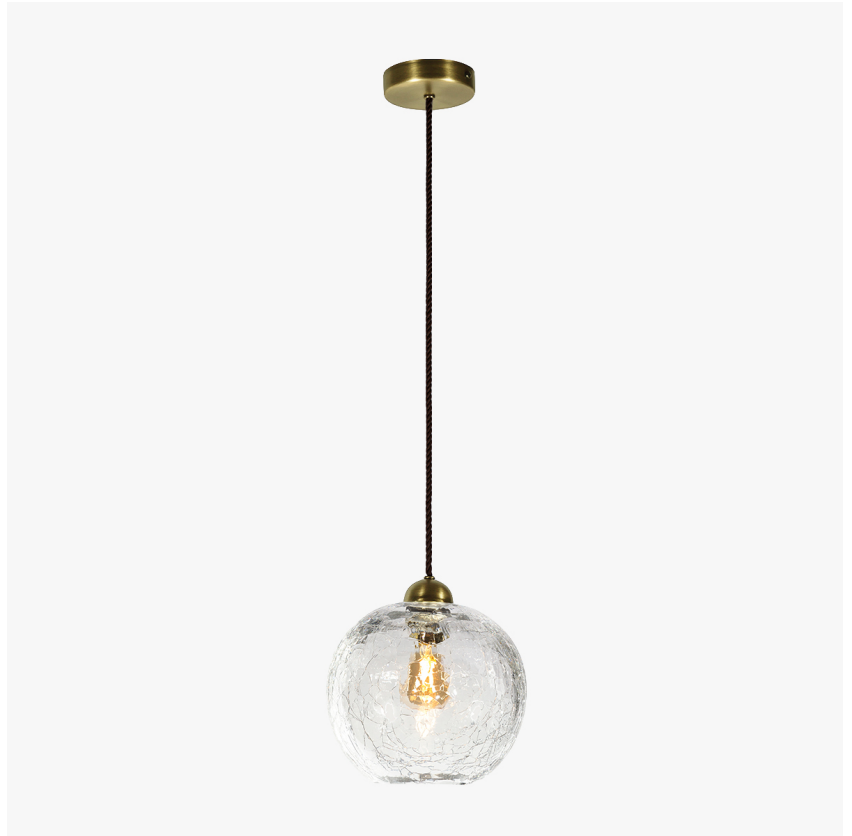
CL375 in Clear Crackled Glass and Brushed Dark Bronze with Brown Flex

Glittering crevasses lace the surface of our Arctic range, glinting flawlessly as they catch the light. A classic crackle technique made in England from pure lead crystal for heightened clarity and allure; these pieces provide stand alone simplicity or are the perfect complement to our intricately cut Glacier range. Use them individually or make use of our customisation service to group several together for a completely individual look.