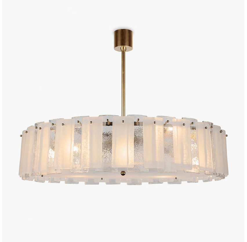
CL213-RO in Satin with Clear Glass and Brushed Gold