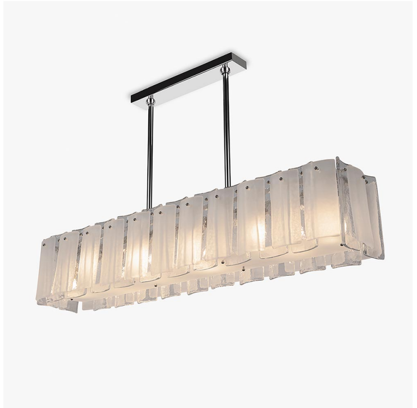
CL213-RECT in Satin with Clear Glass and Polished Nickel