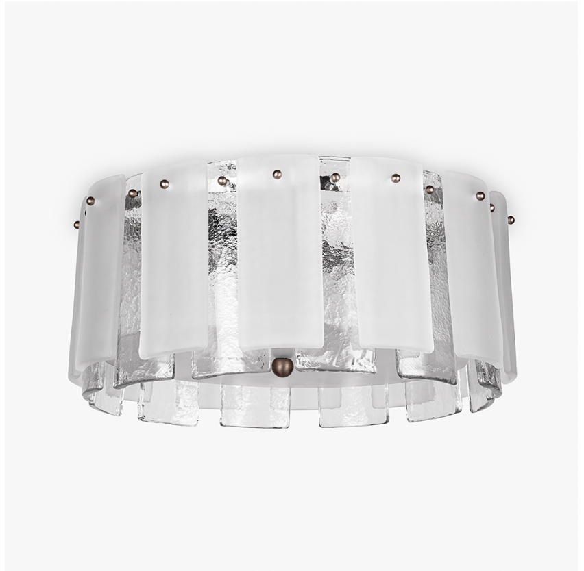
CL213-FM in Satin with Clear Glass and Antique Brushed Brass