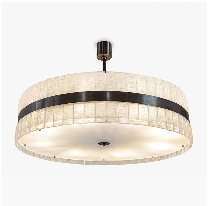
CL132-100 with Hand-carved Lucite and Bronze