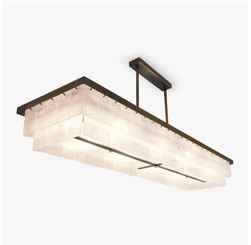
CL125-RECT-150 in Hand-carved Lucite and Brushed Dark Bronze

IEC (International Electrotechnical Commission) test certificates available - will incur a surcharge UL (Underwriters Laboratories) test certificates available for the USA - will incur a surcharge