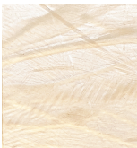
Clear Hand-Carved Lucite