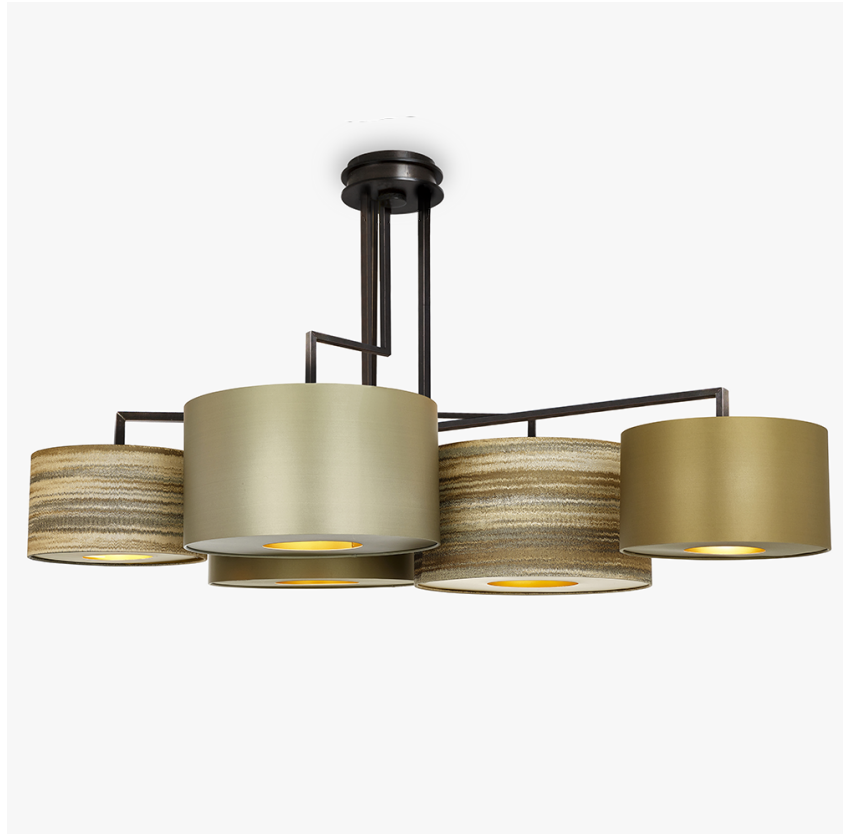
CL100-5 in Bronze with 16 Inch Shades in COM Fabric 'Idrios Patina' from Romo and 1806W Timber Wolf