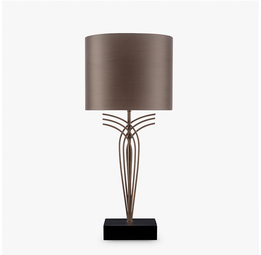
TL209 in Brushed Dark Bronze with a 12" Oval 38000/136 Manta Ray