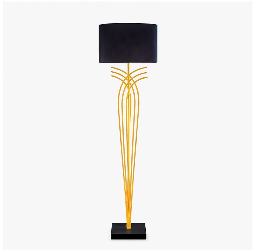
FL209 in Brushed Gold with an 18" Oval Shade in James Hare Midnight 8308/03 Velvet

The Brandt series throws us back into the Art Deco era with a sleek and confident design inspired by one of the most accomplished metalsmiths of the time, Edgar Brandt. The sweeping lines of the original motif are made current by simplification, creating this impressive and highly adaptable design, which gleams as the light falls upon its surface. The table lamp and floor lamp in this series are made with a solid glass base, in your choice of a statement Gloss Black or soft, ethereal Satin which echoes the celestial look which runs throughout the Moonlight collection.