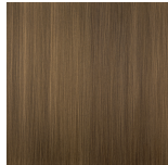
Antique Brushed Brass