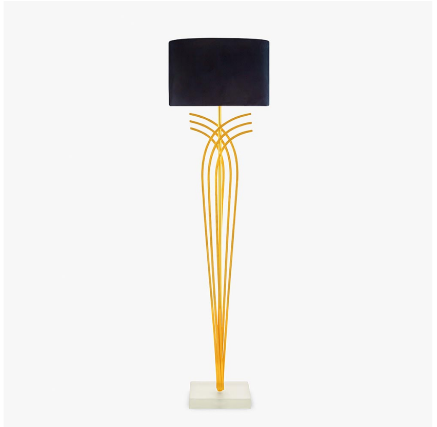
FL209 in Brushed Gold with an 18" Oval Shade in James Hare Midnight 8308/03 Velvet

The Brandt series throws us back into the Art Deco era with a sleek and confident design inspired by one of the most accomplished metalsmiths of the time, Edgar Brandt. The sweeping lines of the original motif are made current by simplification, creating this impressive and highly adaptable design, which gleams as the light falls upon its surface. The table lamp and floor lamp in this series are made with a solid glass base, in your choice of a statement Gloss Black or soft, ethereal Satin which echoes the celestial look which runs throughout the Moonlight collection.