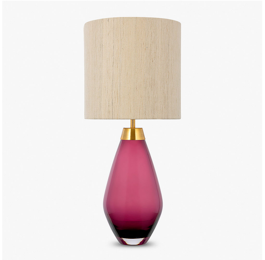
Bijou Lamp in Heliotrope and Brushed Gold with 9" Tall Drum Shade in Silk Linen 3998/Natural N