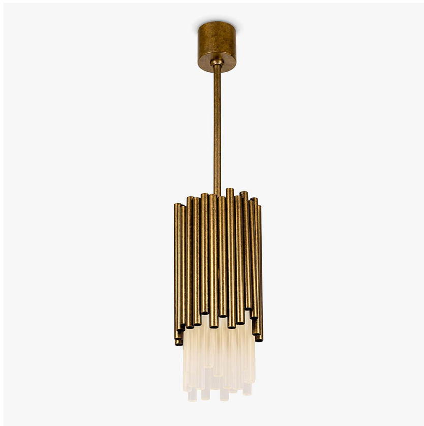
CL109-PEN in Frosted Lucite Rods and Stippled Gold Rods