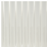
Clear Lucite Rods