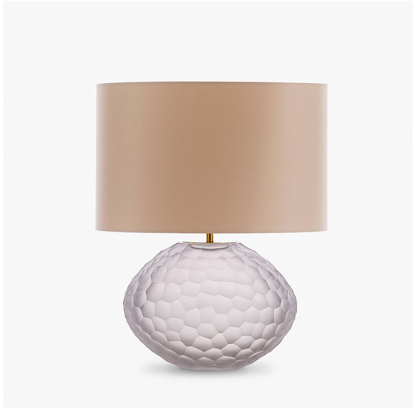
TL234 in Clear Glass and Brushed Gold with a 15" Oval Shade in Crepe Satin 1806W 012 Frosted Almond