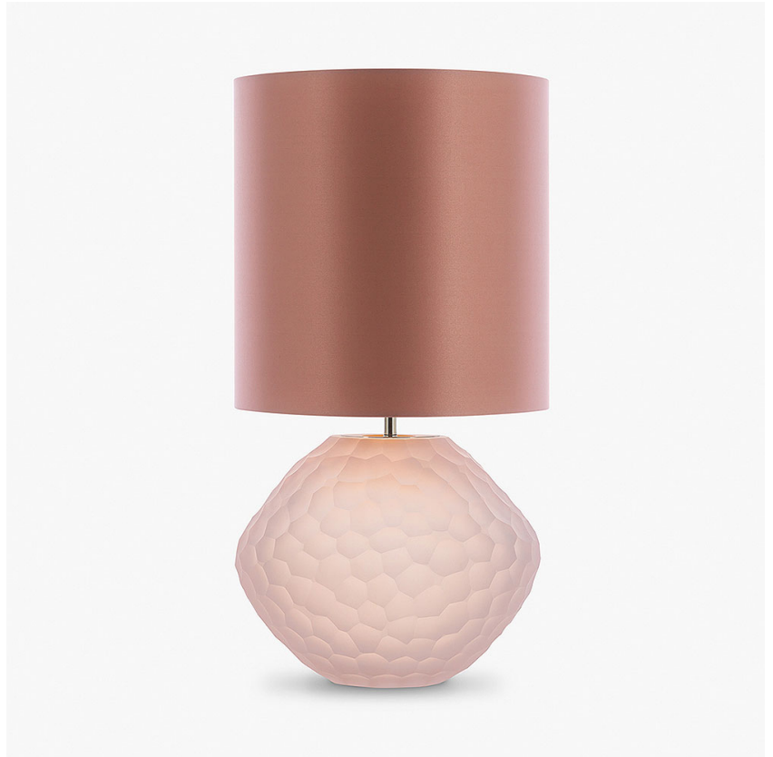
TL234 in Blush Pink Glass and Brushed Nickel with a 11" Tall Drum Shade in Crepe Satin 1806W 22 India