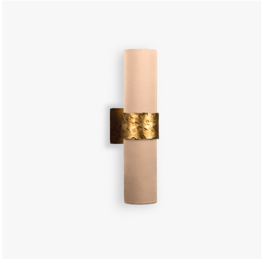
WL57 in Hammered Antique Gold and WL57-Shades in Crepe Satin 1806W/ 012 Frosted Almond

The perfect addition to the Canterbury collection and inspired by the heavyweight Anvil metal working tool used to hammer and beat metal into shape. The Anvil wall light is made up of an individual ring of beaten metal, in which sits double ended slender shades. Which together create elegant framework, crafted in our metal workshop in Italy.