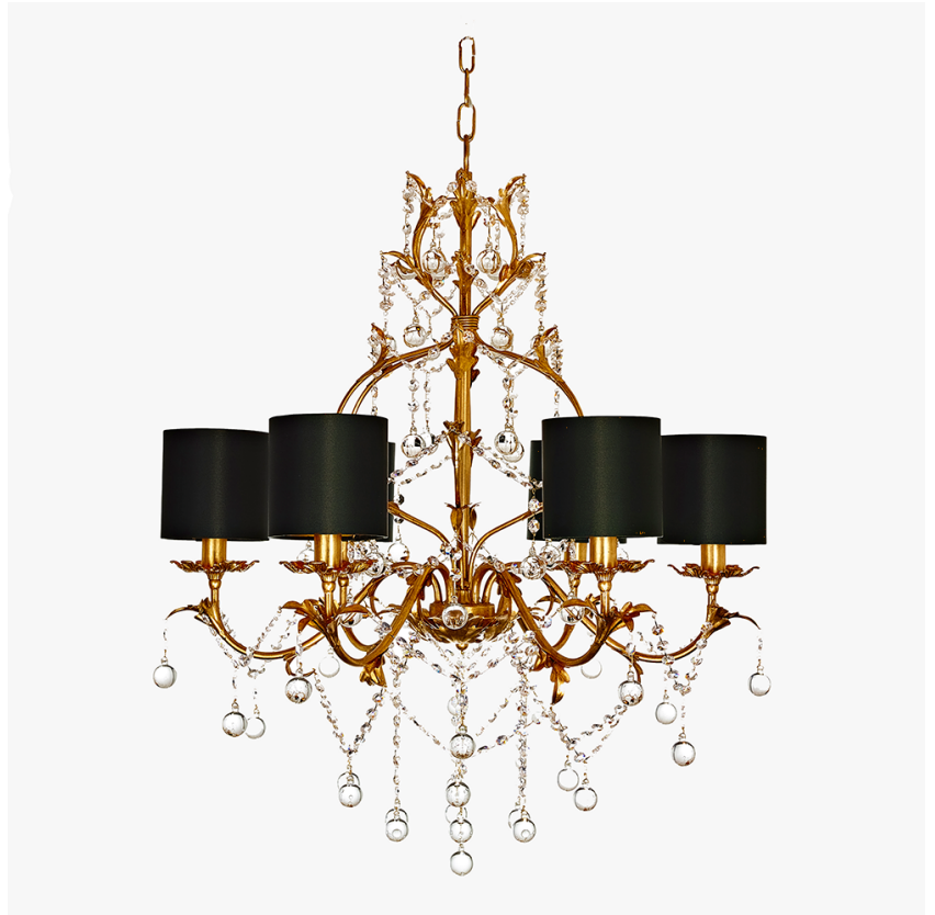
CL77-6 in Antique Gold with 5 Inch Shades in Crepe Satin 1806W/

IEC (International Electrotechnical Commission) test certificates available - will incur a surcharge UL (Underwriters Laboratories) test certificates available for the USA - will incur a surcharge