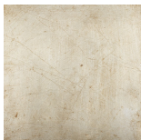
Antique Silver Leaf