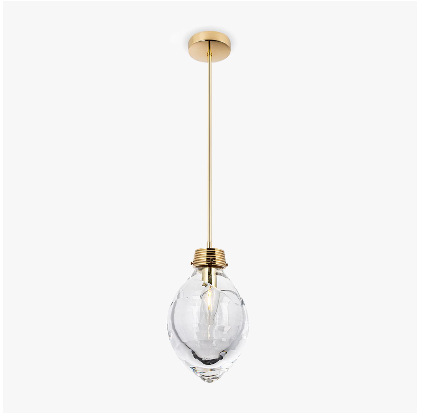
CL660-PEN in Clear Glass and a Polished Brass Rod

Joining the Acorn family, the new Acorn pendant is a delicate design, each one is wrapped in a generous layer of glass, creating an abstract glass ribbon. Hand-crafted in our glass workshop in Britain, available in clear glass only, with either a rod or flex cord.